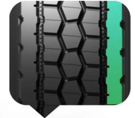
SOLID SHOULDERS WEAR RESISTANCE