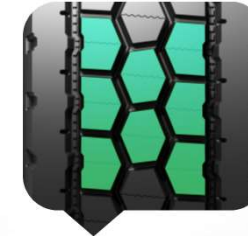
RUGGED BLOCKS SUPERIOR TRACTION